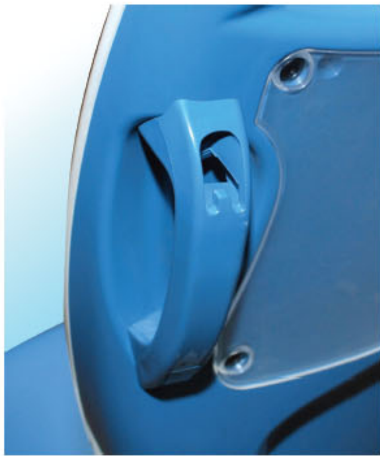
Moulded Side Grip