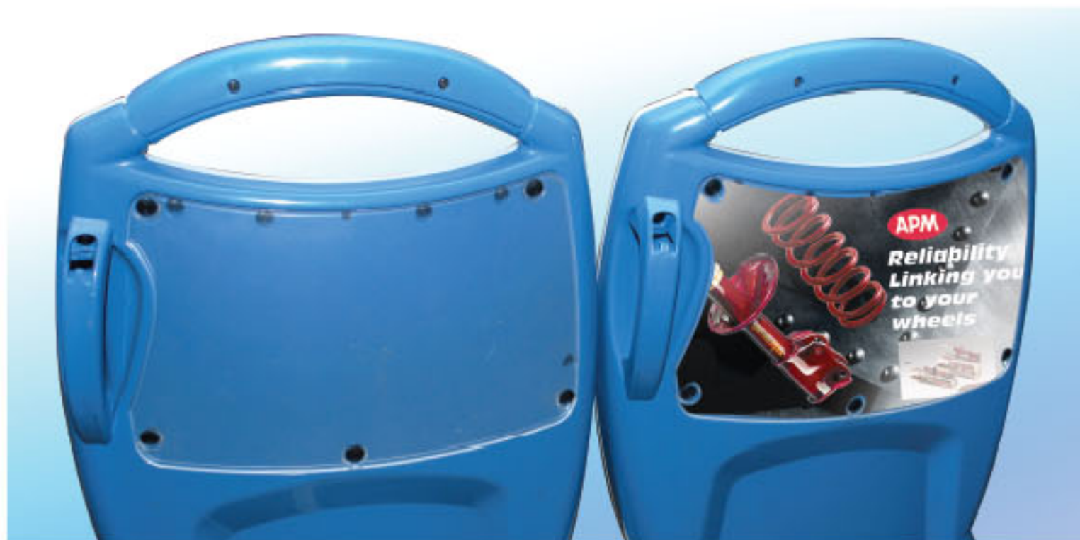
Clear Plastic Advertising Space